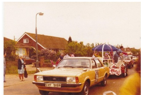
Costessey celebrating the Queen's Silver Jubilee with a procession through the streets.