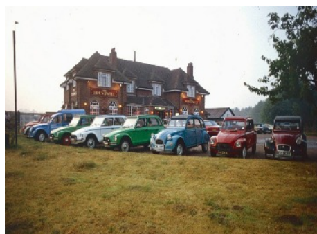
1983 2CV Rally at The Roundwell Pub, demolished to build the Medical Practice