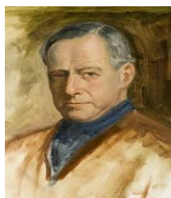
Sir Alfred Munnings